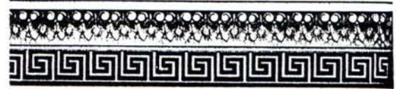
Victorian wallpaper by Scalamandré from Lindenwald, Martin Van Buren's home, c.1840

Mansion restoration projects from early days to the present, created the historically faithful fabrics for the draperies in Lenfell