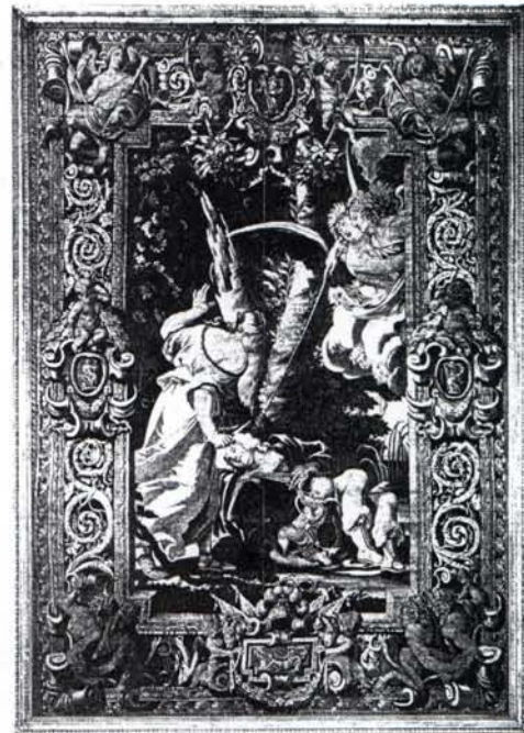
Paris Pre-Gobelins Tapestry "Armida discovers the sleeping Rinaldo, c.1640.

Yet the sales figures are only part of the story. The longer-term significance of the "Florham" auction was that it marked the twilight of a way of life that will probably never be replicated in the U.S. There's little doubt that this "sense of an ending" motivated many of the 1,000 people—curious local residents, window-shoppers, wealthy socialites, and determined dealers—who swarmed the grounds