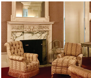
COZY SITTING AREA