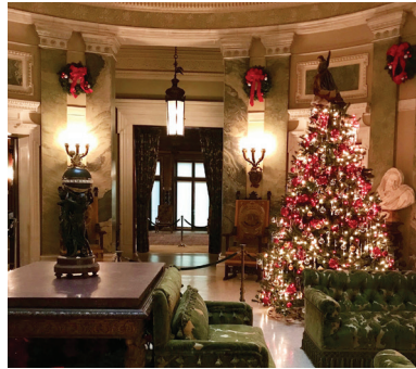
MANSION LIVING ROOM