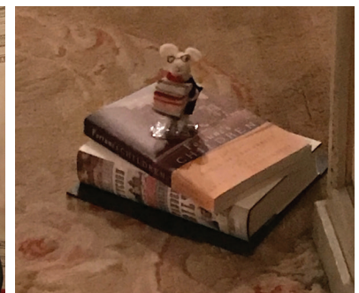
A WELCOMING MOUSE