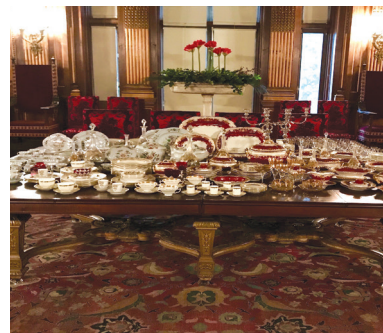
BEAUTIFUL VANDERBILT CHINA