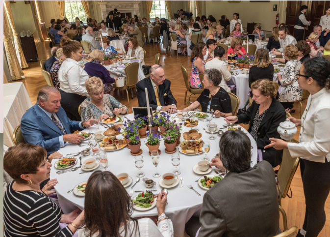
GUESTS ENJOYING THE DAY IN LENFELL HALL