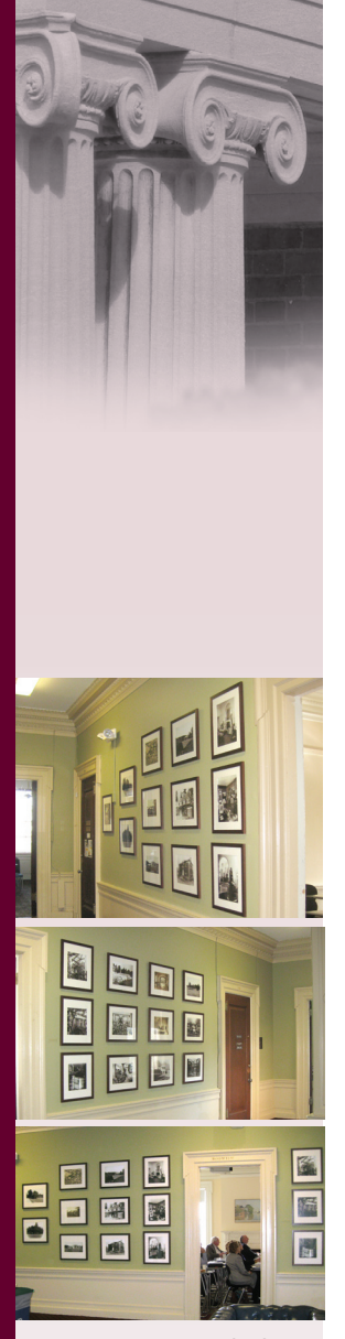
NEW BURDEN PHOTO-Graphs in Hennessy Hall