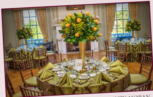
ROOM SETTING BY GALA CO-CHAIR SUZY MORAN