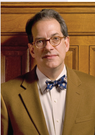
ULYSSES GRANT DIETZ