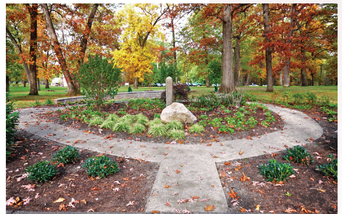
THE WALTER SAVAGE MEDITATION AREA AND ORCHARD

of the history of the buildings and grounds and of the lives of the Twombly family, which he generously shared with new faculty, and tours of the Friends events were enormous and invaluable.