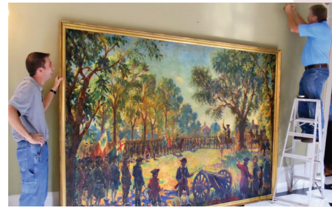
WORKMEN REHANGING “GEORGE WASHINGTON INSPECTING THE TROOPS AT CAMBRIDGE, MASSACHUSETTS”