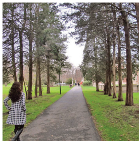
WALKWAY NEXT TO THE ITALIAN GARDENS WITH HENNESSY HALL IN THE DISTANCE