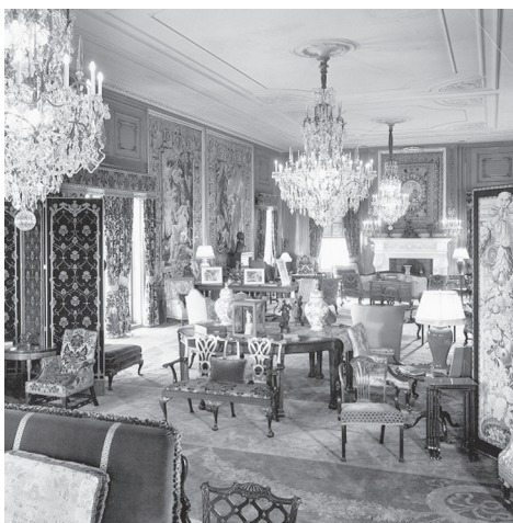
TWOMBLY FAMILY DRAWING ROOM (NOW LENFELL HALL).