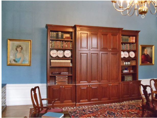
THE BOOKCASE FLANKED BY SAMMARTINO PORTRAITS

addition to traditional mahogany blinds, an impressive blue-and-red-stripe drapery was hung in the President's Office, and additional window treatments were hung in the outer office. An Italian velvet foulard on the two