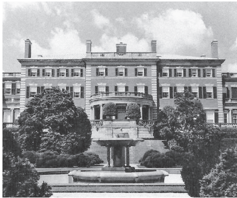
REAR OF MANSION (NOW HENNESSY HALL). JUNE 1939.

All of us who love Florham are well familiar with all the known photographs of the estate, which many of us have studied time and again, sometimes with a magnifying glass. In Florham we are treated to the most incredible collection of never-before-seen photographs from the 1930s and early 1940s when the estate was at its peak. We see the lower terrace gardens behind the back of the mansion; inside the Orangerie and the garden next to it; and the gardener's quarters. We look out from the second floor of the mansion after a blizzard with the shrubs protected by wooden enclosures; the luscious cherry-paneled rooms inside Miss Ruth's Playhouse; a