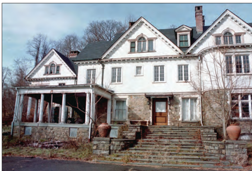
Hurstmont as it looks today.