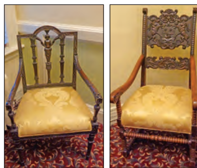
The chairs restored.