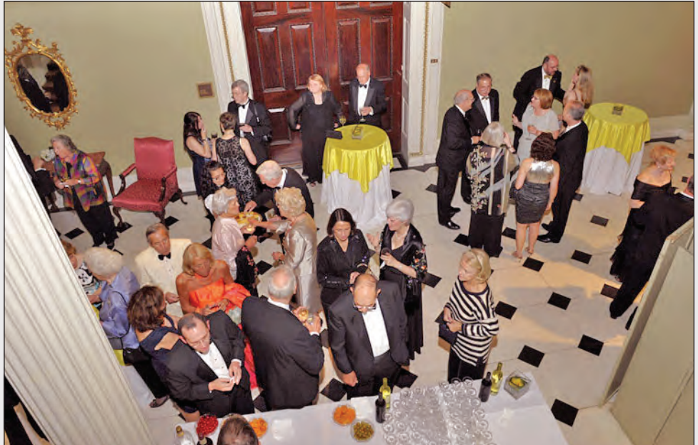
Guests enjoyed refreshments in the "Great Hall."