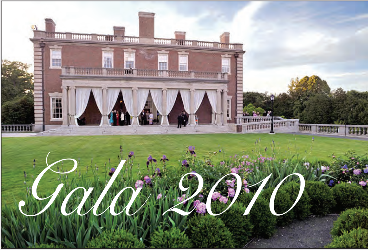
The rear portico of Lenfell Hall, Hennessy Hall, elegantly draped and filled with guests.