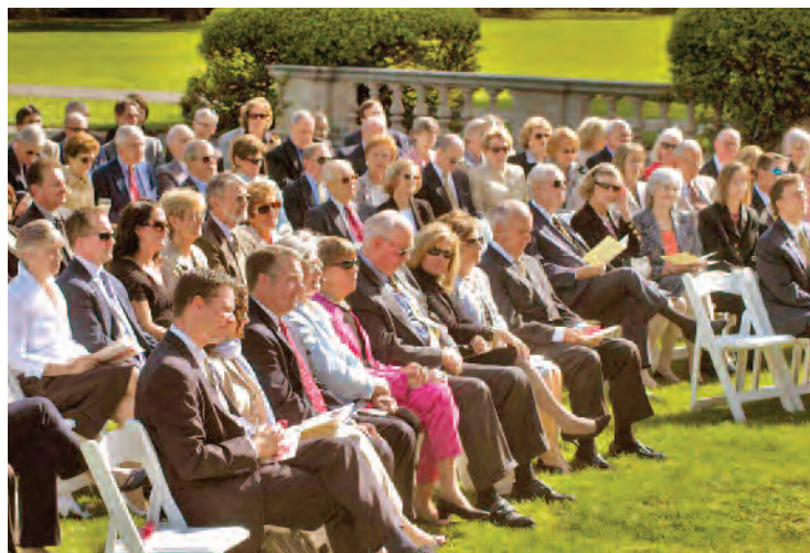
The Hennessy Hall dedication was held on a lovely spring day.