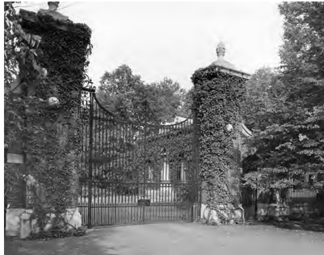
The "Front Gate" with gatehouse to the right.

Turn left after walking into Lenfell Hall from the Twombly Mansion's Great Hall, then left again to face a painting depicting two rather