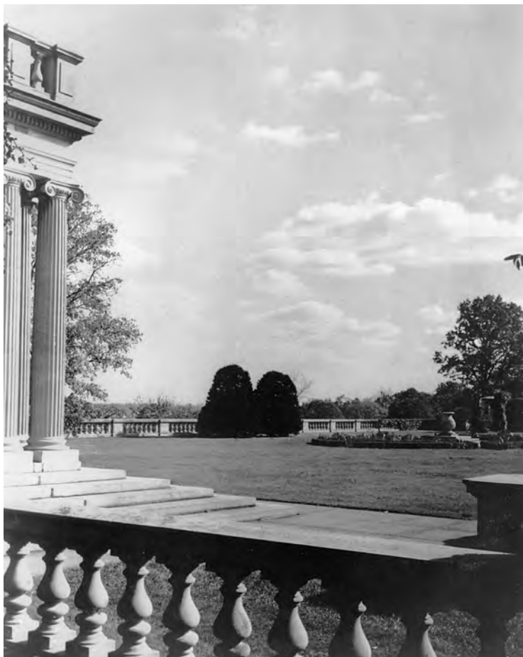
View of the Italian Garden with the southeast corner of the Mansion porch in the foreground.