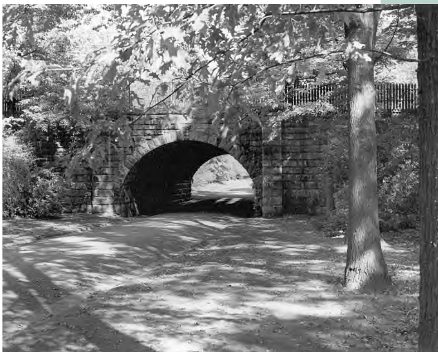
The railroad overpass on the entrance road leading from Madison Avenue.