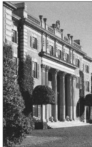
The mansion during the Twombly’s time.

work necessary to bring it back to this level of perfection, four years after Ruth Twombly’s death? We do know from research Carol Bere has done that the Florham expenses dropped from $250,000 to $90,000 just before the University took over; how much of the estate was kept up and how much had gone feral?